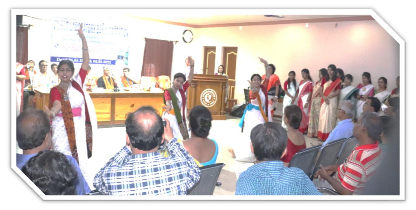
Inaugural Ceremony of World Laboratory Day