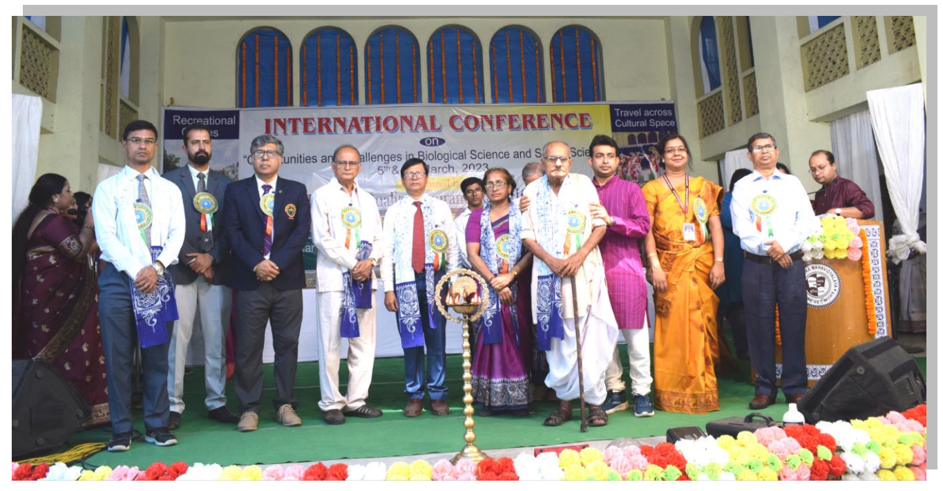
Inaugural Ceremony of International Conference on 5th & 6th March, 2023