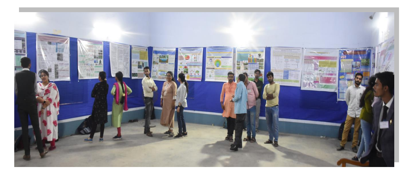
Poster Presentation on International Conference