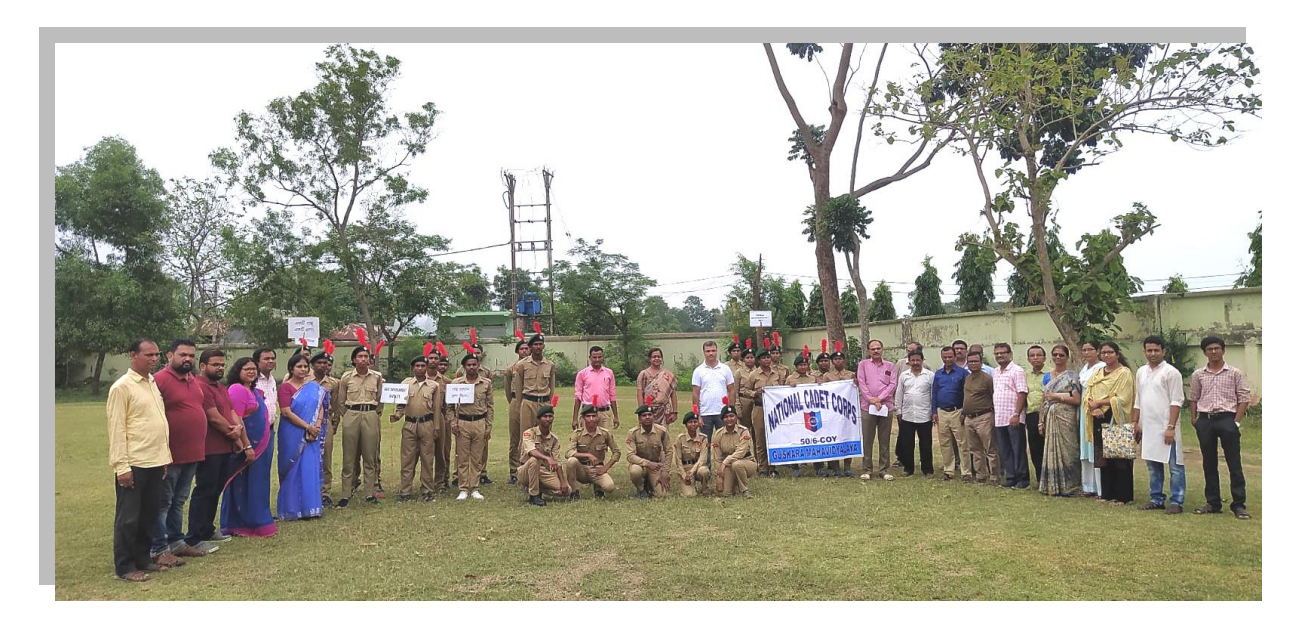
Tree Plantation on World Environment Day by NCC