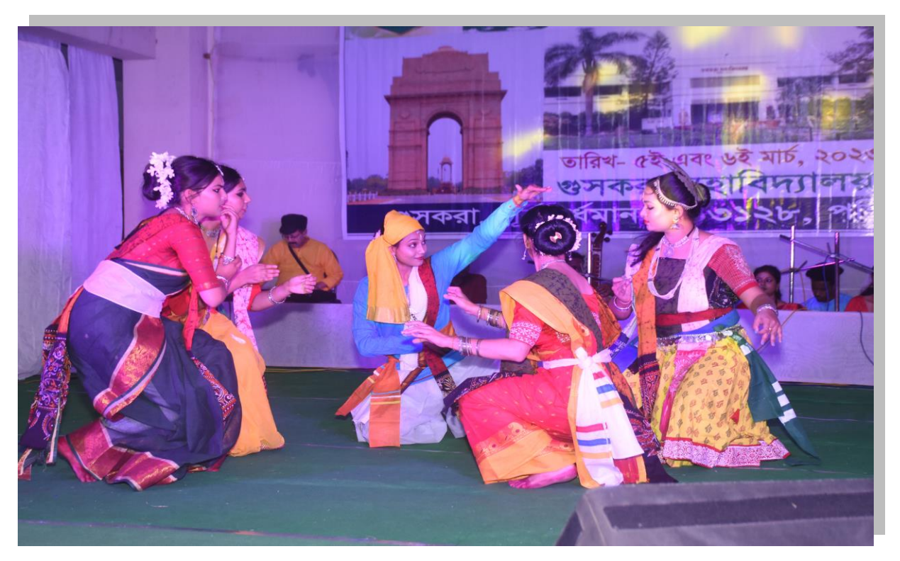
Cultural Programme on International Conference