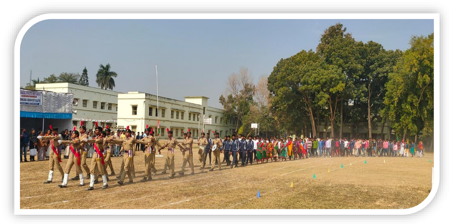
NCC, NSS Volunteers and Participants in Annual Sports