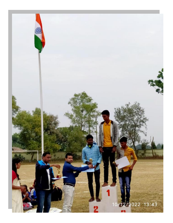
Prize Distribution on Annual Sports