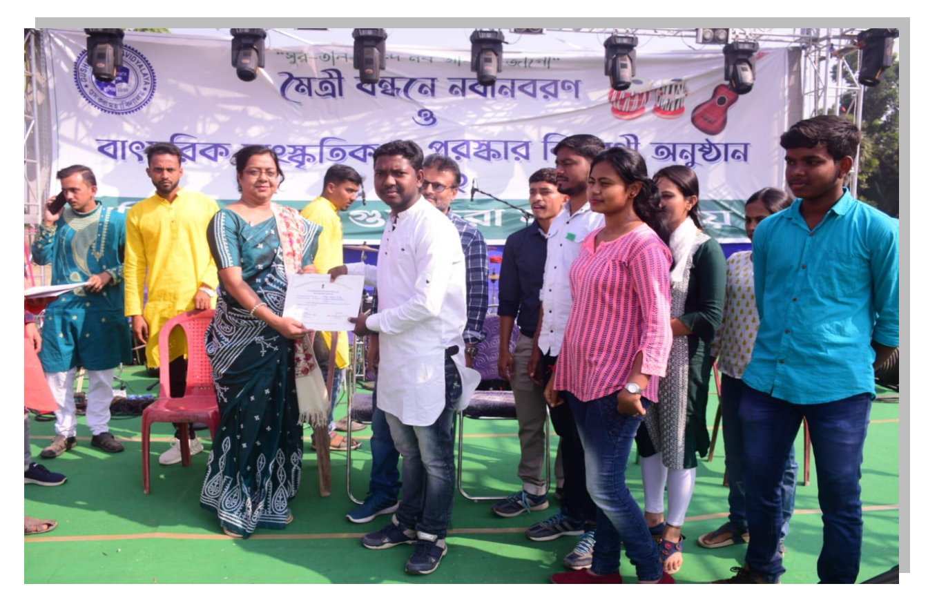
Annual Cultural Programme